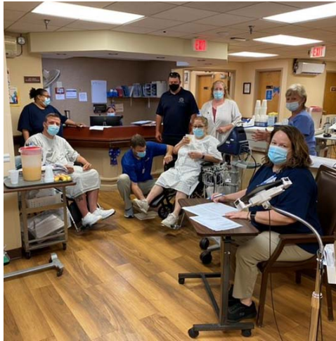
Photo: Triage / Intake Area – Absolut Care of Gasport, Gasport, NY