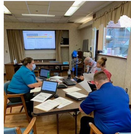
Photo: DSF Command Center – Ira Davenport Memorial Hospital SNF, Bath, NY