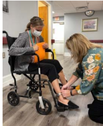
Photo: Triage/ Intake Area & wander-guard application – The Manor at Bethany Village, Horseheads, NY