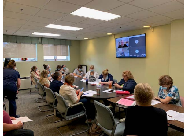
Photo: RAF Command Center – Huntington Living Center, Waterloo, NY

LTC-MAP members took this full-scale exercise as an opportunity to stand up their internal leadership / incident management team and setup a command center within their facilities. Some plan members took the opportunity to invite and work with community partners. Local Fire Departments, EMS, Emergency Management Directors and Local Health Departments were onsite in some member's command centers to help manage the simulated disaster, build relationships, and work together.